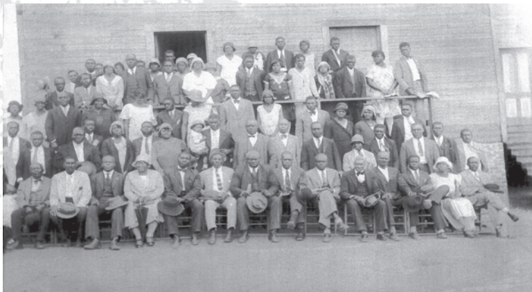
Early Seven Shapenote Singing Class in the Wiregrass Area

Sacred Harp singers of Mississippi transpose the four note scale to seven notes as they sing is a result of their decision to use B.F. White's four note Sacred Harp songbook published in 1844 with the rudiments outlined in William Walker's seven note Christian Harmony songbook published in 1866. The consequences of this adapted singing style has made the Black Sacred Harp State Singing Convention one of the most outstanding and exceptional within the shapenote genre. "