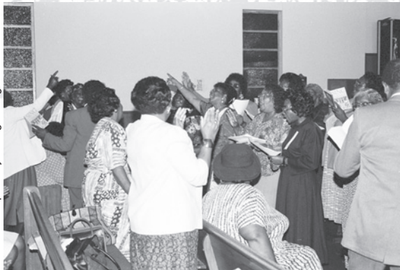
All State Singing Convention Prichard AL 1995