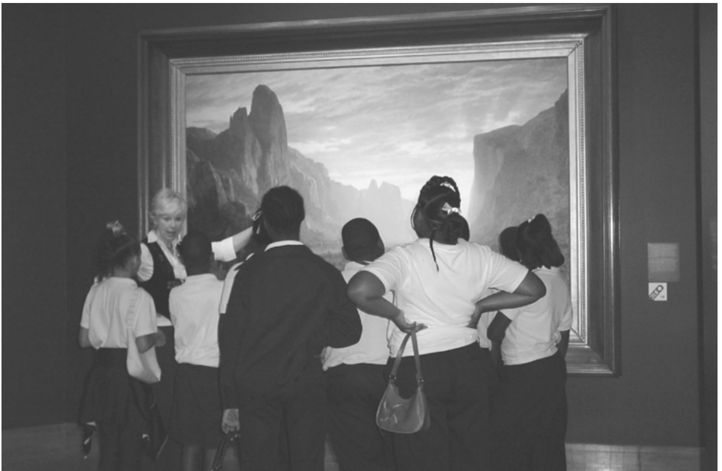
Discussion at the Birmingham Museum of Art regarding the painting by American artist, Albert Bierstadt, entitled Looking Down Yosemite Valley, California. Oil on Canvas, 1865.