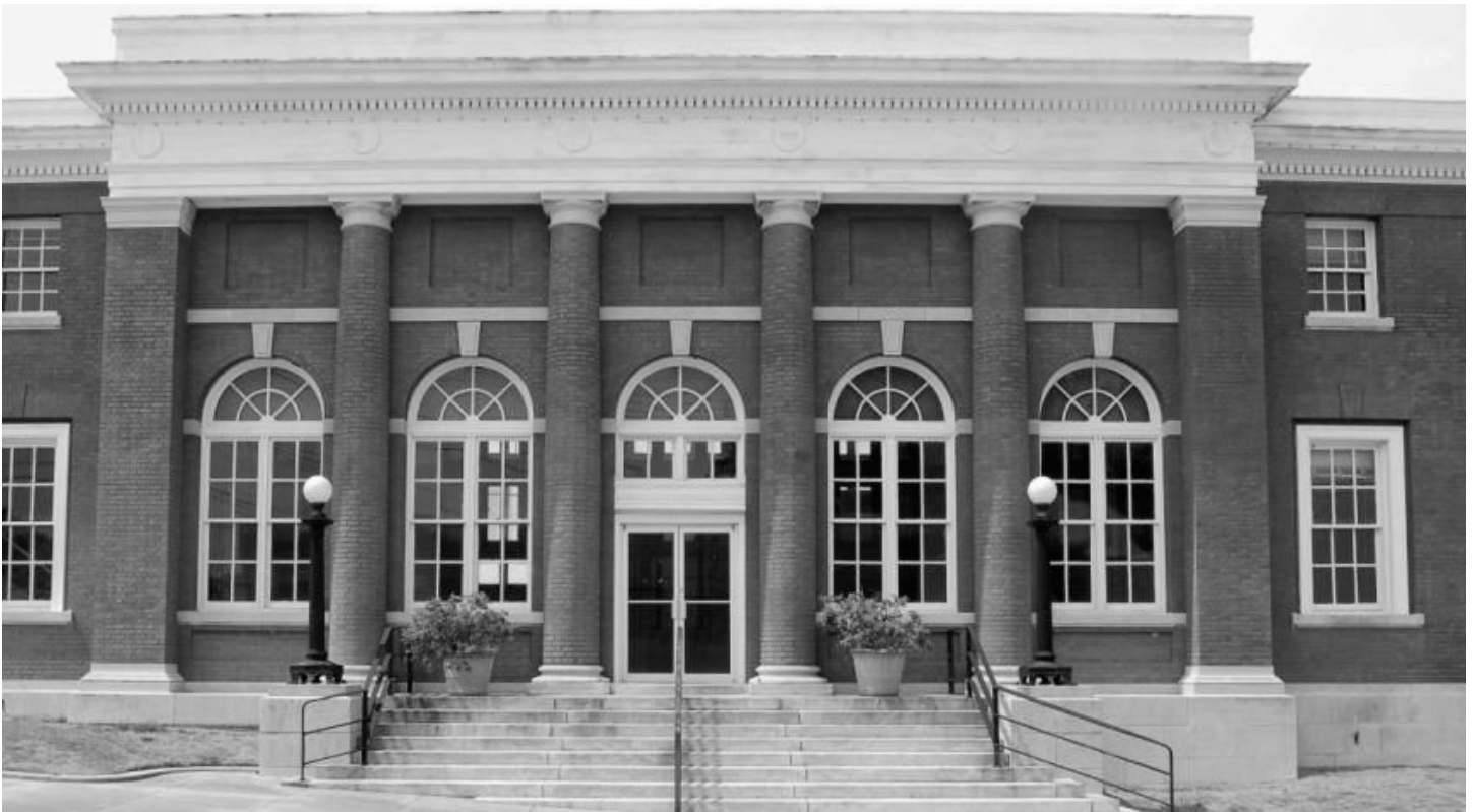
Troy-Pike Cultural Arts Center converted Troy's former post office into a community arts facility.

Requests for design work related to a specific facility or an arts space will be considered for support. Proposed work in this phase must produce a tangible design in the form of blueprints, renderings, schematics or other documents necessary for construction, renovation, installation or adaptive reuse of the facility or space in question. Qualified and certified architects and design professionals must be involved in and selected as part of the application process. A design document will be expected at the end of the grant period (details adequate for construction bids or construction management by certified professionals). Submission of design work will be required before final grant funds are released. Grants in this area will generally not exceed $50,000. All grants must be matched dollar-for-dollar in cash and in-kind services.